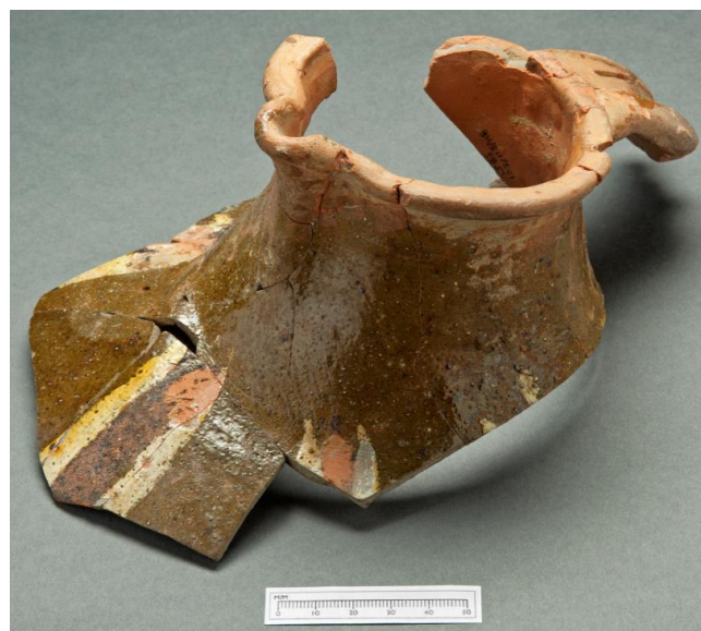
Figure 1. One of the slipped and glazed jugs from Langport being analysed by ICP at the DARC Lab.

Several projects involving medieval ceramics from the south-west of England are currently being developed at DARC. One project includes samples for analysis by ICP-AES and -MS provided by Michael Hughes from a kiln in Devon. The goal is to better understand the circulation of the material from this production site in south-western England. Another project, involves the analysis of a large group of medieval brown-glazed jugs from Langport, Somerset. For a very long time most, if not all, of these jugs, found at sites in Somerset, Bristol, Devon, Wiltshire and Dorset, were identified by researchers as coming from the large production site at Donyatt in South Somerset. Research led by John Allan, Michael Hughes, and others (1999), using ICP and thin-section petrography, has demonstrated that fabric identification by eye and/or microscope is not reliable enough to distinguish between similar looking products coming from south, west, and east Somerset, including products from less well known centres at Nether Stowey or Crowcombe. For this area, chemical analysis with ICP has proven essential for identifying the production centres. The current research project promises to help advance our understanding of this long-lived industry in the West Country.